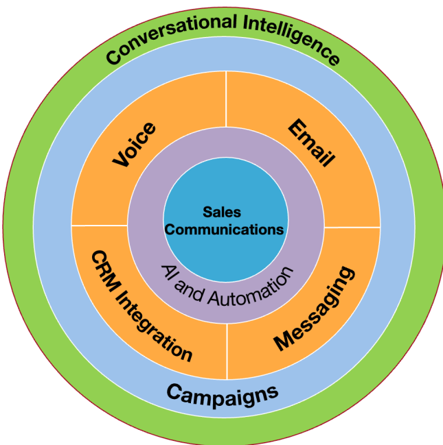
Figure 1: Sales enablement platforms are becoming more intelligent to help teams with productivity and overall engagement.

One of the key things to consider when buying an SEP is not just the ability to share content, but how well the offering works for sales learning. This puts more pressure on buyers to do critical evaluations of vendors. Aragon feels that microlearning is a critical capability for sales learning.